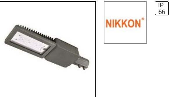
NIKKON S431 LEDXION SOLAR POWERED 21W LED Street Lantern DIMMING SYSTEM (5000K)

21W LED STREET LANTERN DIMMING SYSTEM (5000K) S431 LEDXION SOLAR POWERED NIKKON