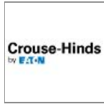
Champ MLLA Hazardous Area Linear LED Light