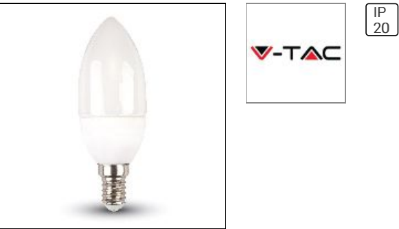
V-TAC 3.7W LED Bulb E14 Candle 4000K

V-TAC 3.7W LED BULB E14 CANDLE 4000K 214166 V-TAC