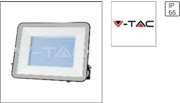
V-TAC 300W LED Floodlight SMD SAMSUNG CHIP PRO-S Black Body 4000K

V-TAC 300W LED FLOODLIGHT SMD SAMSUNG CHIP PRO-S BLACK BODY 4000K 10031 V-TAC