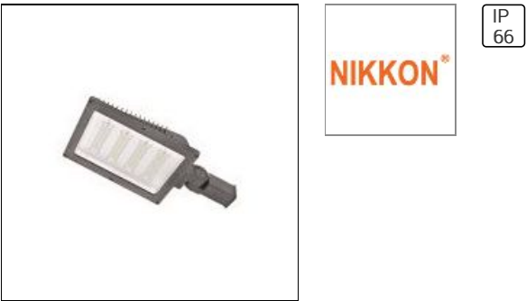
NIKKON S2266 LEDXION K10119 230W LED Floodlight (MB51) Type 2 (3000K)

230W LED FLOODLIGHT (MB51) TYPE 2 (3000K) S2266 LEDXION K10119 NIKKON