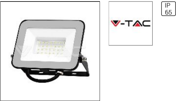
V-TAC 30W LED Floodlight SMD SAMSUNG CHIP PRO-S Black Body 4000K

V-TAC 30W LED FLOODLIGHT SMD SAMSUNG CHIP PRO-S BLACK BODY 4000K 10021 V-TAC