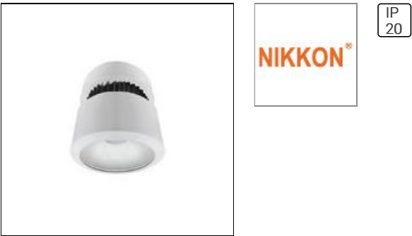
NIKKON BRONZO K01130 27.8W LED AC Cube Surface Downlight (3000K)

27.8W LED AC CUBE SURFACE DOWNLIGHT (3000K) BRONZO K01130 NIKKON