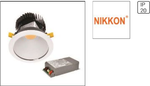
NIKKON LEDXION K01115 39W LED Downlight (3000K)

39W LED DOWNLIGHT (3000K) LEDXION K01115 NIKKON