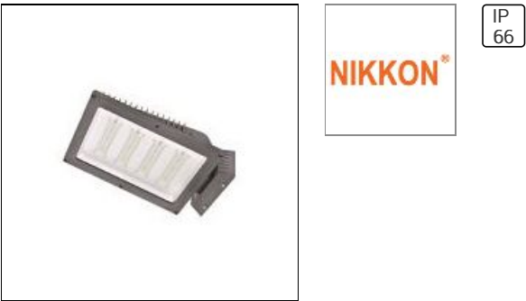
NIKKON S2266 LEDXION K10119 140W LED Floodlight (NB19) Type 3 (5000K)

140W LED FLOODLIGHT (NB19) TYPE 3 (5000K) S2266 LEDXION K10119 NIKKON