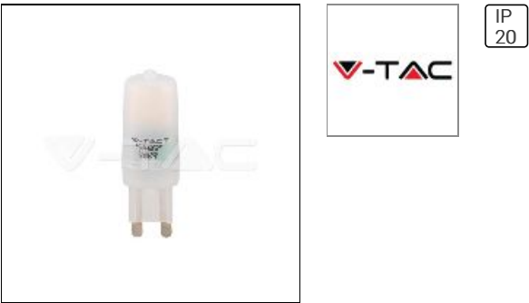
V-TAC LED Spotlight SAMSUNG CHIP - G9 2.2W Plastic 3000K

V-TAC LED SPOTLIGHT SAMSUNG CHIP - G9 2.2W PLASTIC 3000K 20478 V-TAC