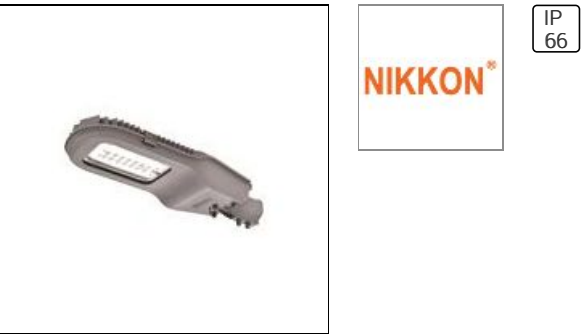
NIKKON S439 LEDXION SOLAR POWERED SLD SERIES 40W LED Street Lantern (5000K)

40W LED STREET LANTERN (5000K) S439 LEDXION SOLAR POWERED SLD SERIES NIKKON