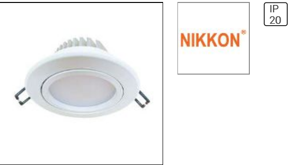
NIKKON LEDXION K01117 13W LED Downlight (3500K)

13W LED DOWNLIGHT (3500K) LEDXION K01117 NIKKON