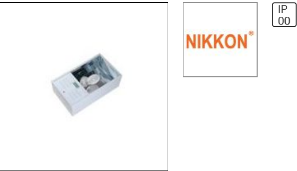
NIKKON NL150 SMR H0080 c/w HPMV 80W Bulb Lamp

H0080 HPMV 80W BULB LAMP NL150SMR NIKKON