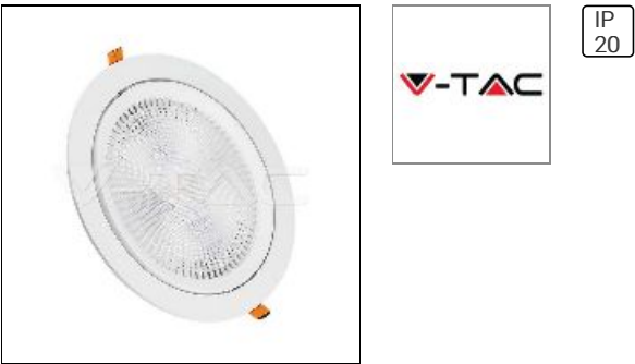
V-TAC 10W LED Downlight SAMSUNG CHIP 4000K

V-TAC 10W LED DOWNLIGHT SAMSUNG CHIP 4000K 21840 V-TAC