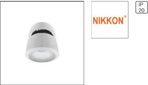
NIKKON BRONZO K01130 25.3W LED AC Cube Surface Downlight (4000K)

25.3W LED AC CUBE SURFACE DOWNLIGHT (4000K) BRONZO K01130 NIKKON