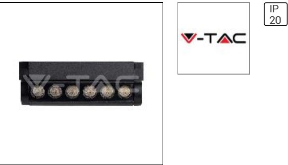
V-TAC 5W LED Magnetic Linear Spotlight Slim Adjustable 4000K Black Body

V-TAC 5W LED MAGNETIC LINEAR SPOTLIGHT SLIM ADJUSTABLE 4000K BLACK BODY 10257 V-TAC