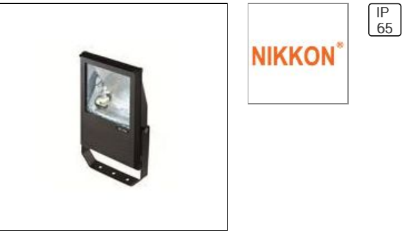
NIKKON S0701 S0070 Floodlight c/w HPS 70W Double Ended Lamp

S0070 HPS 70W DOUBLE ENDED LAMP S0701 NIKKON