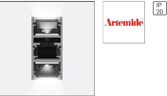
A.24 SOSP. MODULO DIR. DIFF. 2700K 2352mm BSV

A.24 SOSP. MODULO DIR. DIFF. 2700K 2352MM BSV AQ41715 ARTEMIDE