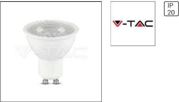
V-TAC LED Spotlight SAMSUNG CHIP - GU10 7.5W 38° With Lens 6500K

V-TAC LED SPOTLIGHT SAMSUNG CHIP - GU10 7.5W 38° WITH LENS 6500K 21877 V-TAC