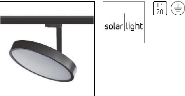
Moon w/50mm extension Spot 30w Blk 930

MOON W/50MM EXTENSION SPOT 30W BLK 930 5705150099731 SOLAR