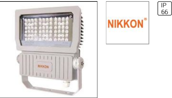
NIKKON S2125 LEDXION K10127 100W LED Floodlight (MB51) (3000K)

100W LED FLOODLIGHT (MB51) (3000K) S2125 LEDXION K10127 NIKKON