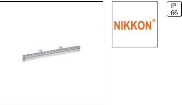
NIKKON LEDXION K04103 18W LED Fluorescent (6500K)

18W LED FLUORESCENT (6500K) LEDXION K04103 NIKKON