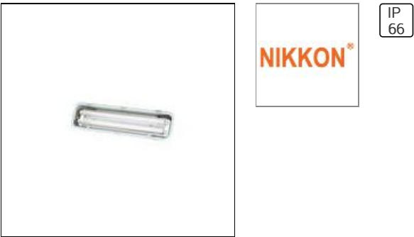
NIKKON S8218 T8 IP66 Stainless Steel Fitting c/w 18W Fluorescent Lamp

T8 IP66 STAINLESS STEEL FITTING S8218 NIKKON