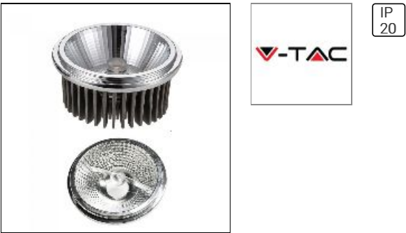
V-TAC 20W LED Spotlight AR111 Changeable Reflector 40°D/20°D Silver 3000K

V-TAC 20W LED SPOTLIGHT AR111 CHANGEABLE REFLECTOR 40°D/20°D SILVER 3000K 2792 V-TAC