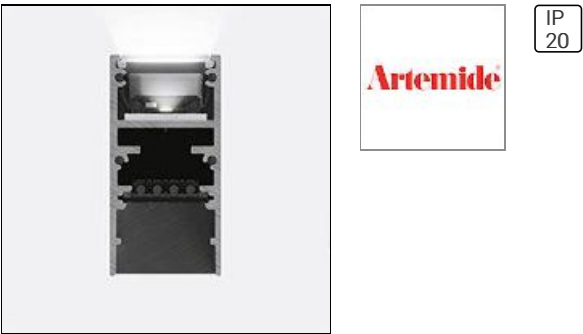
A.24 SOSP. BINARIO MAGNETICO + INDIRETTA 2700K 2352mm BBRZ

A.24 SOSP. BINARIO MAGNETICO + INDIRETTA 2700K 2352MM BBRZ AQ40720 ARTEMIDE