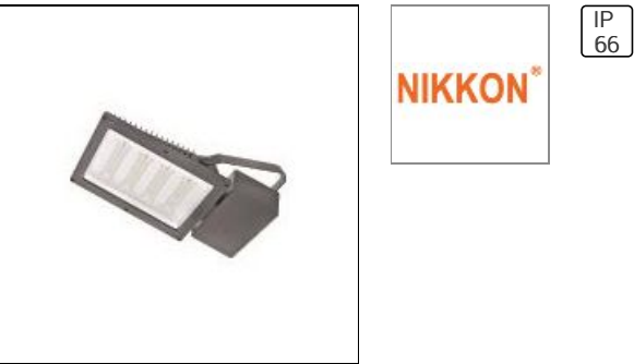
NIKKON LEDXION K10119 140W LED Floodlight (NB19) Type 1 (5000K)

140W LED FLOODLIGHT (NB19) TYPE 1 (5000K) S2266 LEDXION K10119 NIKKON