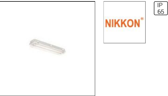
NIKKON N218 T8 IP65 Weather Proof Fitting c/w 18W Fluorescent Lamp

T8 IP65 WEATHER PROOF FITTING N218 NIKKON