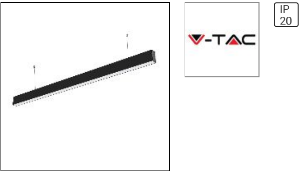
V-TAC 40W LED Linear Light SAMSUNG CHIP Hanging Suspension Black Body 3000K 1200x35x67mm

V-TAC 40W LED LINEAR LIGHT SAMSUNG CHIP HANGING SUSPENSION BLACK BODY 3000K 1200X35X67MM 882 V-TAC