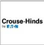
Champ DLLA Hazardous Area Linear LED Light