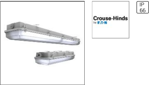
Pauluhn FPS Industrial Linear LED Light

FPS LED FPS2L-EM2 (NORMAL MODE) EATON'S CROUSE HINDS