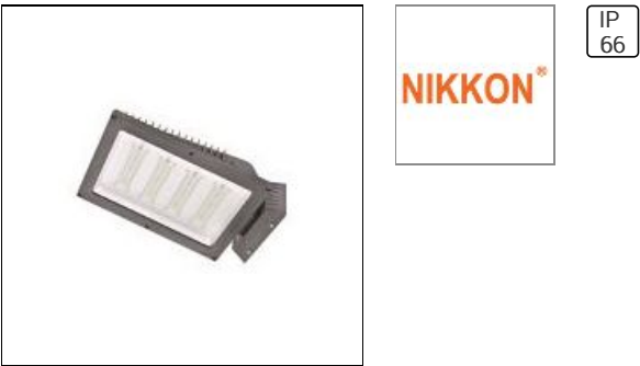
NIKKON S2266 LEDXION K10119 140W LED Floodlight (WB) Type 3 (5000K)

140W LED FLOODLIGHT (WB) TYPE 3 (5000K) S2266 LEDXION K10119 NIKKON