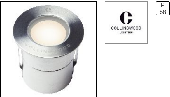
A Frosted 1w mini LED ground Marker light.

GL019 FROSTED NW GL019DC0F40 COLLINGWOOD