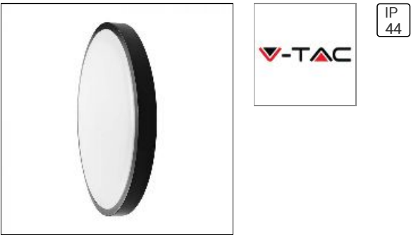
V-TAC VT-8618S 18W LED DOME LIGHT MICROWAVE SENSOR 4000K ROUND BLACK FRAME IP44

V-TAC VT-8618S 18W LED DOME LIGHT MICROWAVE SENSOR 4000K ROUND BLACK FRAME IP44 76691 V-TAC