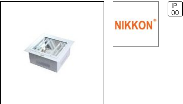
NIKKON NL400 RMS H0400 Lowbay c/w HPMV 400W Bulb Lamp

H0400 HPMV 400W BULB LAMP NL400RMS NIKKON