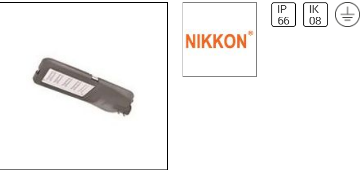
NIKKON S436 EA LEDXION K09220 150W LED Street Lantern (Type 1) (5000K)

150W LED STREET LANTERN (TYPE 1) (5000K) S436 EA LEDXION K09220 NIKKON