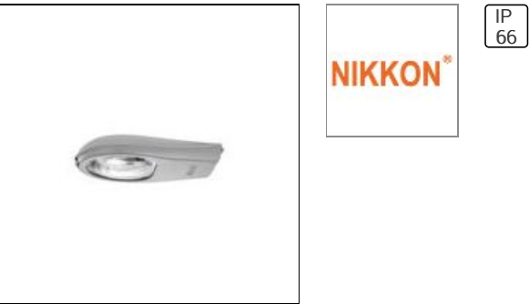
NIKKON S159 S0150 Street Lantern c/w HPS 150W Tube Lamp