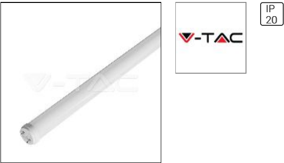
V-TAC LED Tube T8 18W - 120 cm G13 GLASS Tube 3000K 25pcs/Box

V-TAC LED TUBE T8 18W - 120 CM G13 GLASS TUBE 3000K 25PCS/BOX 2981 V-TAC