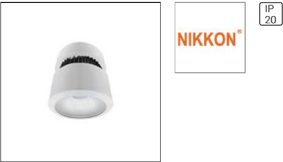
NIKKON BRONZO K01130 11.7W LED AC Cube Surface Downlight (4000K)

11.7W LED AC CUBE SURFACE DOWNLIGHT (4000K) BRONZO K01130 NIKKON