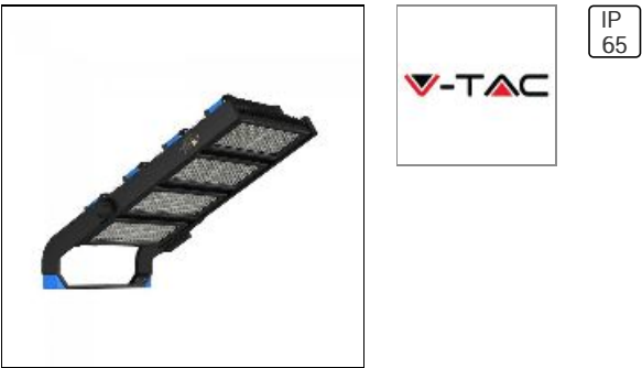
V-TAC 1000W LED Floodlight SAMSUNG CHIP Meanwell Driver 60'D 4000K

V-TAC 1000W LED FLOODLIGHT SAMSUNG CHIP MEANWELL DRIVER 60'D 4000K 499 V-TAC