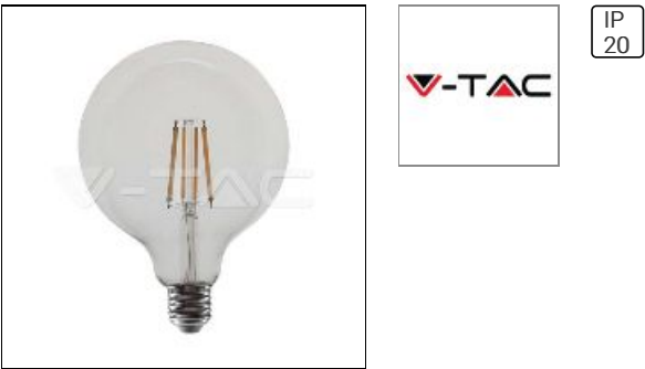
V-TAC LED Bulb - 12W Filament E27 G125 Clear Cover 4000K

V-TAC LED BULB - 12W FILAMENT E27 G125 CLEAR COVER 4000K 217454 V-TAC