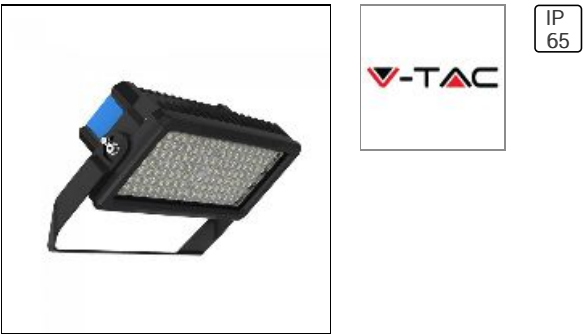
V-TAC 250W LED Floodlight SAMSUNG CHIP Meanwell Driver 120'D 6000K

V-TAC 250W LED FLOODLIGHT SAMSUNG CHIP MEANWELL DRIVER 120'D 6000K 500 V-TAC